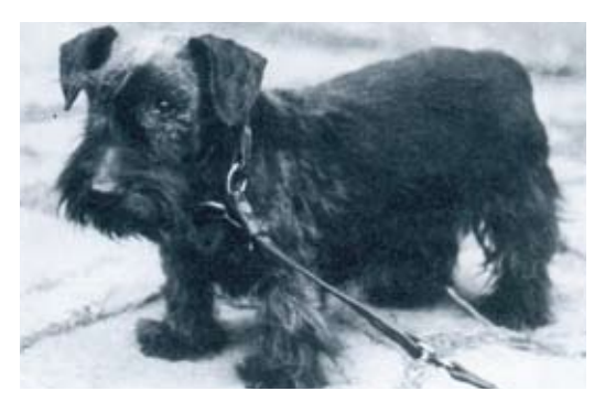
Diana Lovu zdar (Balda Lovu zdar x Scotch Rose)