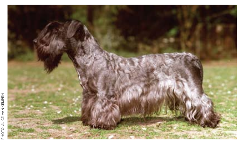
Diana Bohemia Regent (Chram Kvitko x Alida z. Alenciny) was the first non-British Cesky Terrier to win BOS at Crufts.