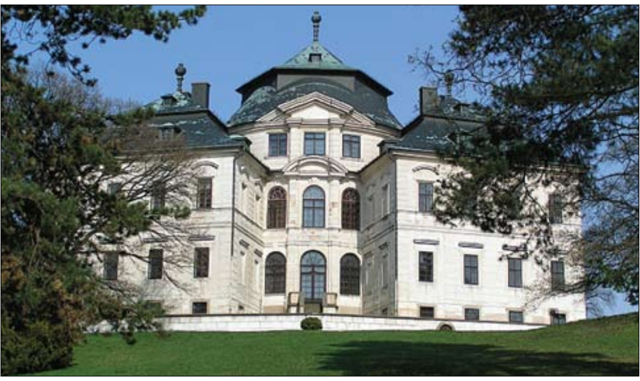
Castle Karovà Koruna