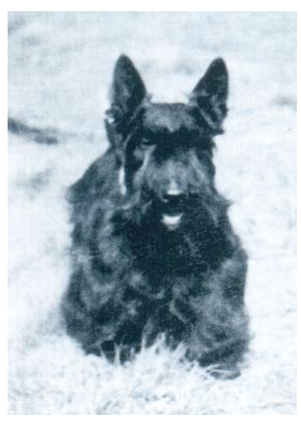
The Scottish Terrier Scotch Rose