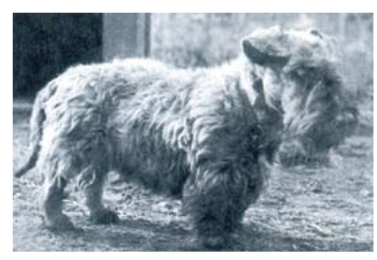
Balda Lovu zdar (Buganier Urquelle x Scotch Rose) born in 1950